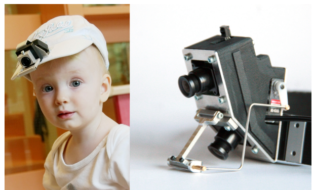
Fig. 1. Left : The WearCam worn by a typically developing 14 months old girl, fixed on a cap. Right : Closeup of the WearCam, with the two cameras and motor-controlled mirror.

In this paper we present a study of 24 children (12 children with ASD, and 12 typically developing) interacting in a natural environment with an adult experimenter. We have chosen a selection of items from the Early Social Communication Scale (ESCS [11]), to display the potential of using the WearCam in the scope of clinical assessment and research. We focus our analysis on the use of gaze across the whole field of view.