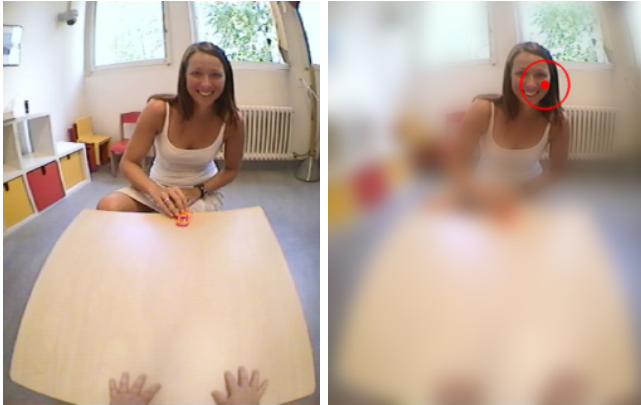
Fig. 3. Image of the interaction with the experimenter recorded from the WearCam. Gaze direction extracted by the eyes image; the region outside central vision ( 10^\circ radius around the gaze point) has been blurred to highlight the direction of gaze.

not seem to interrupt the experiments and did not distract the child.